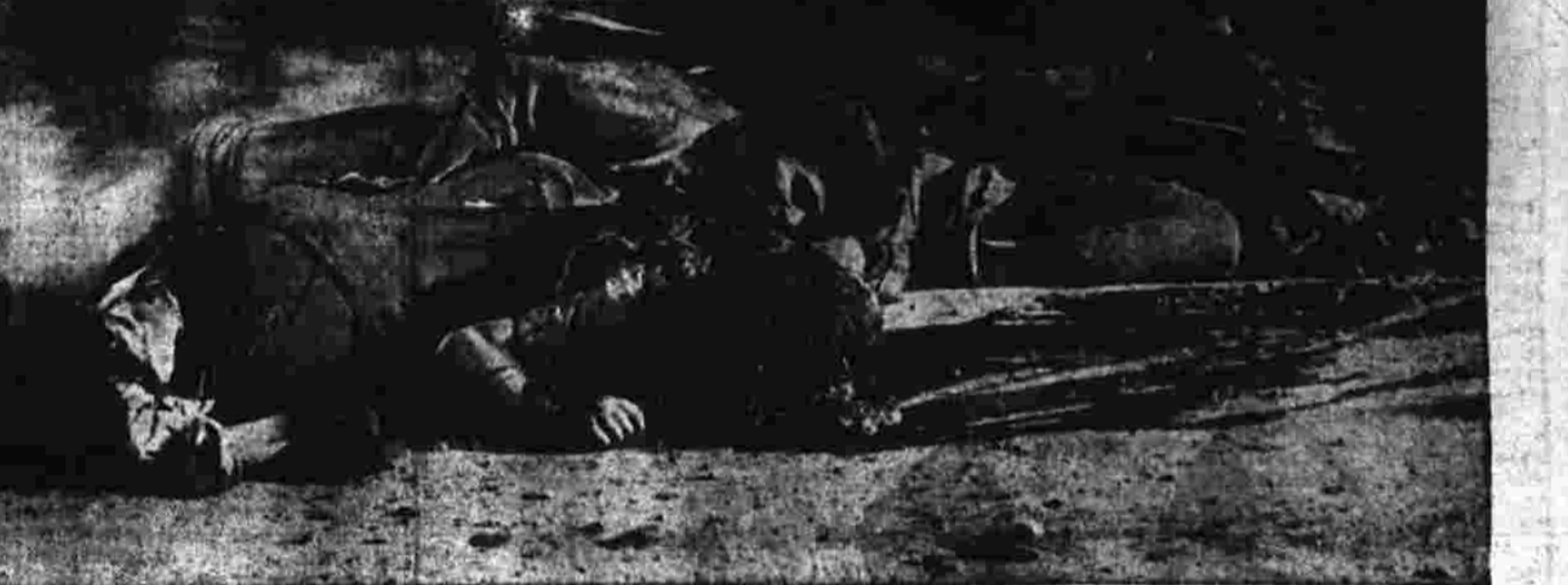
Bodies of Jewish nurses lie in road beside burned-out and bullet-riddled ambulance after Arab attack on Jewish convoy carrying nurses, doctors and patients to Hadassah Hospital near Jerusalem.